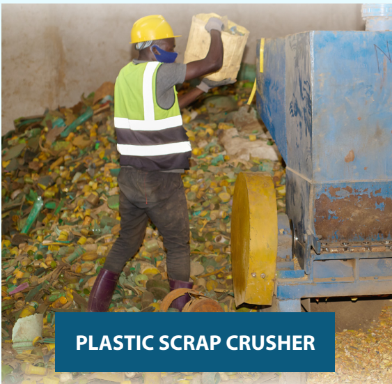
PLASTIC SCRAP CRUSHER

PP and PPE Washing: We offer washing services for PP (polypropylene) and PPE (polyphenylene ether) plastics to remove impurities and contaminants. Our washing process ensures that the recycled plastic meets the highest quality standards and can be used in a variety of applications.