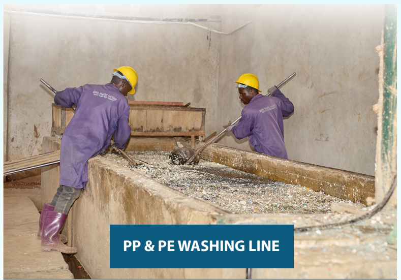
PP & PE WASHING LINE